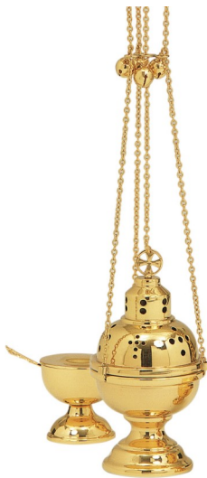
Thurible and Boat