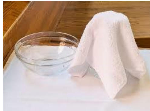
Lavabo and Towel