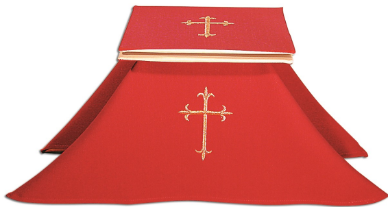
Chalice Veil and Burse