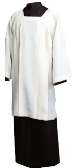
Cassock and surplice