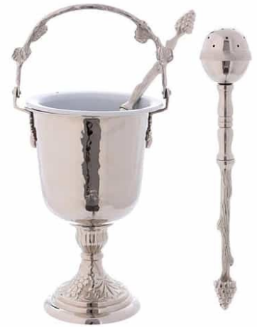
Aspergillum and Bucket