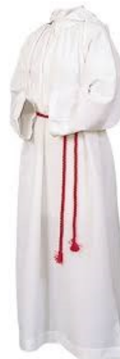
Alb and cincture