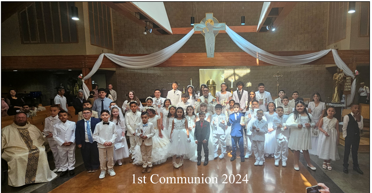
1st Communion 2024