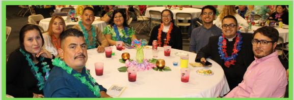
Great times were had at The Last Luau!