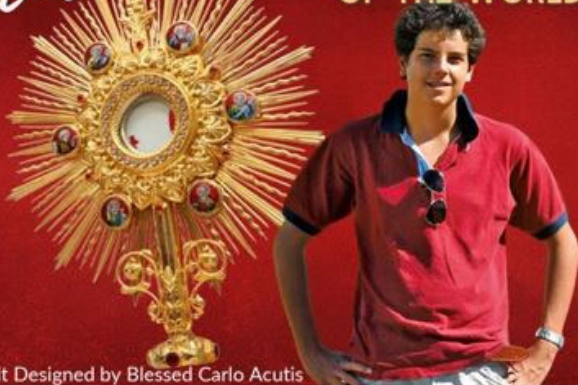
Exhibit Designed by Blessed Carlo Acutis