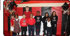
*No all award winners are pictured, there were so many!