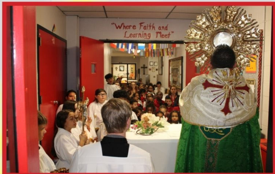
Indoor Eucharistic Procession on October 26, 2023