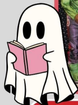
Halloween & Preschool Pumpkin Roll