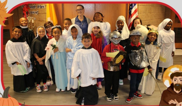
2nd Grade Saints Wax Museum