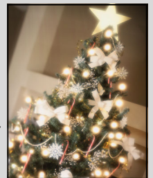
PHOTO WITH SANTA