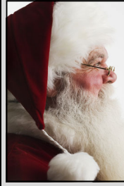
PHOTO WITH SANTA

You better watch out, you better not cry, you better not pout, I'm telling you why, Santa Claus is coming to St. Regis! The Ladies Auxiliary is hosting Photos with Santa or in the Nativity Scene on Sunday, December 1. We are asking $5 a photo. Come to the Gathering Space and you will be directed to the photo room in the Academy. Santa will be available for photos from 11am to 2pm.