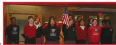
Our 5th Grade Scholars honored Veteran's by reciting In Flanders Fields and singing God Bless the USA .