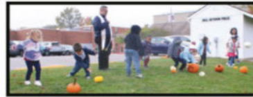
The annual Preschool Pumpkin Roll!

To support the Eagle Trot scholarship drive, please scan the QR code or use this link: http://bit.ly/3CnSAT3