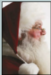
PHOTO WITH SANTA

You better watch out, you better not cry, you better not pout, I'm telling you why, Santa Claus is coming to St. Regis! The Ladies Auxiliary is hosting Photos with Santa or in the Nativity Scene on Sunday, December 1 . We are asking $5 a photo. Come to the Gathering Space and you will be directed to the photo room in the Academy. Santa will be available for photos from 11am to 2pm.