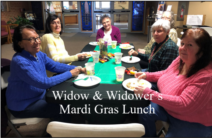
Widow & Widower's Mardi Gras Lunch