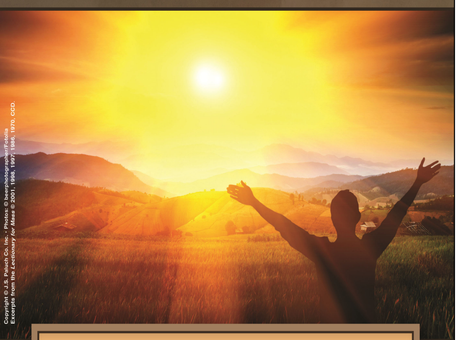
Copyright © J.S. Paluch Co. Inc. Excerpts from the Lectioary for Mass © 2001, 1998, 1997, 1986, 1970, CCB.

ONE OF THE LEPERS, REALIZING HE HAD BEEN HEALED, RETURNED, GLORIFYING GOD IN A LOUD VOICE.