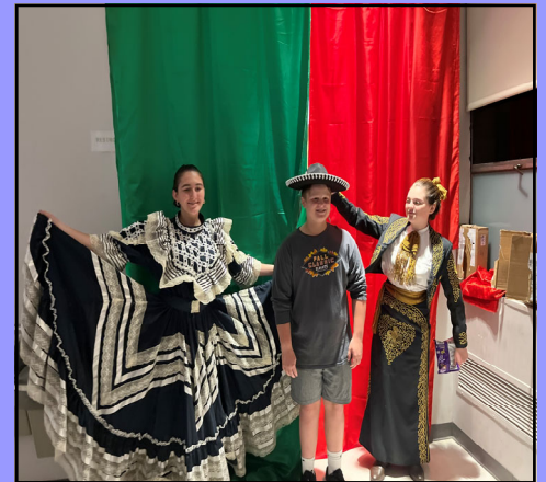
Multicultural Festival 2022