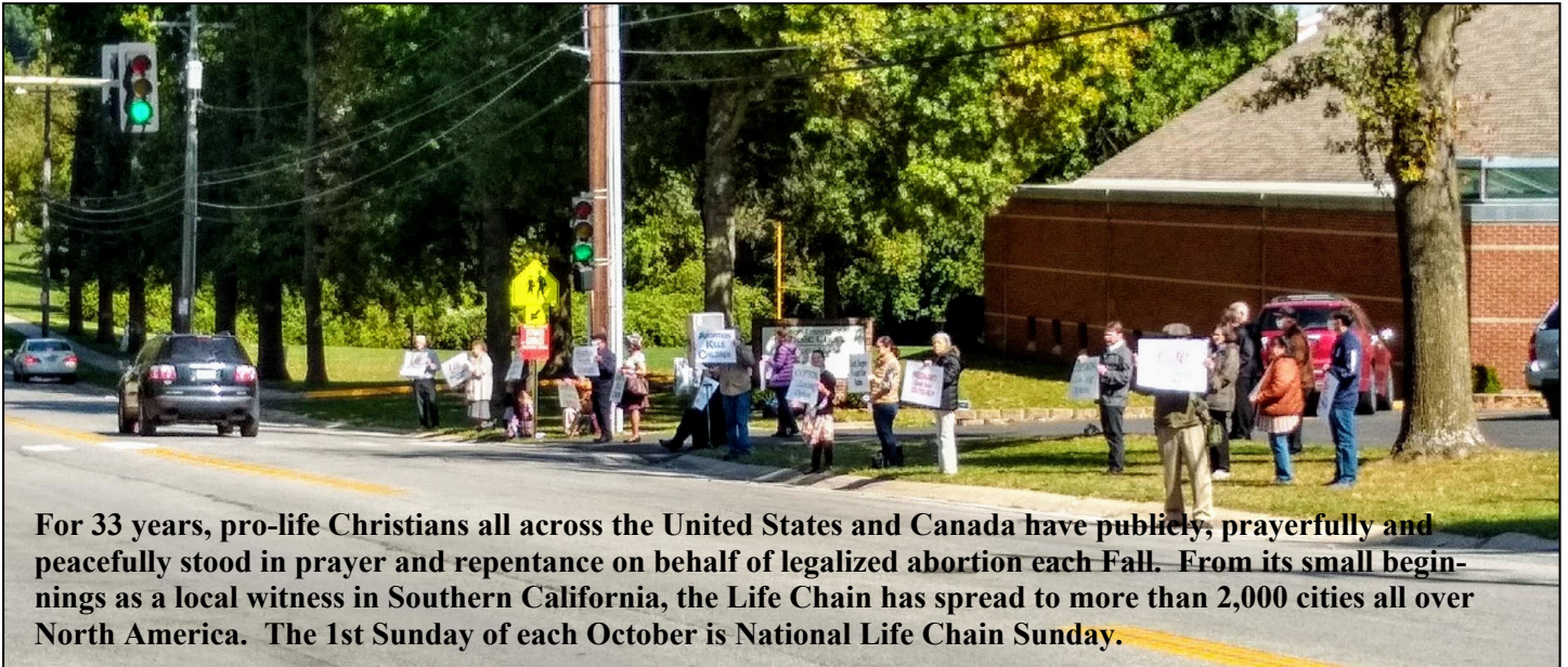
For 33 years, pro-life Christians all across the United States and Canada have publicly, prayerfully and peacefully stood in prayer and repentance on behalf of legalized abortion each Fall. From its small beginnings as a local witness in Southern California, the Life Chain has spread to more than 2,000 cities all over North America. The 1st Sunday of each October is National Life Chain Sunday.