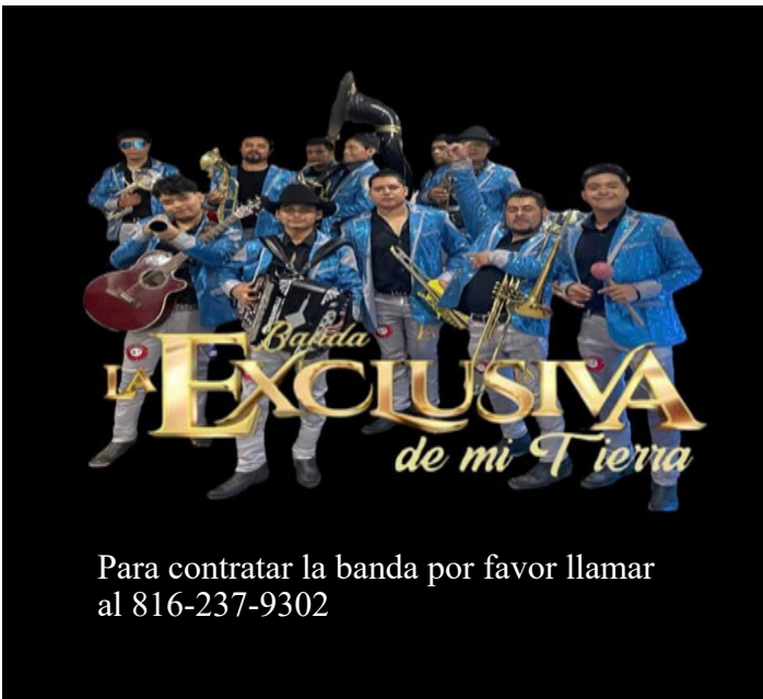
Para contratar la banda por favor llamar al 816-237-9302