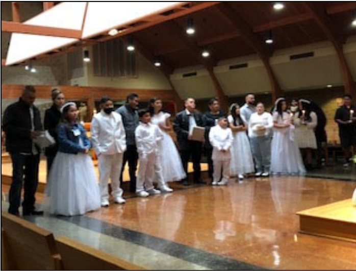
Congratulations to the members of the RCIC Class that received their sacraments on November 12th.