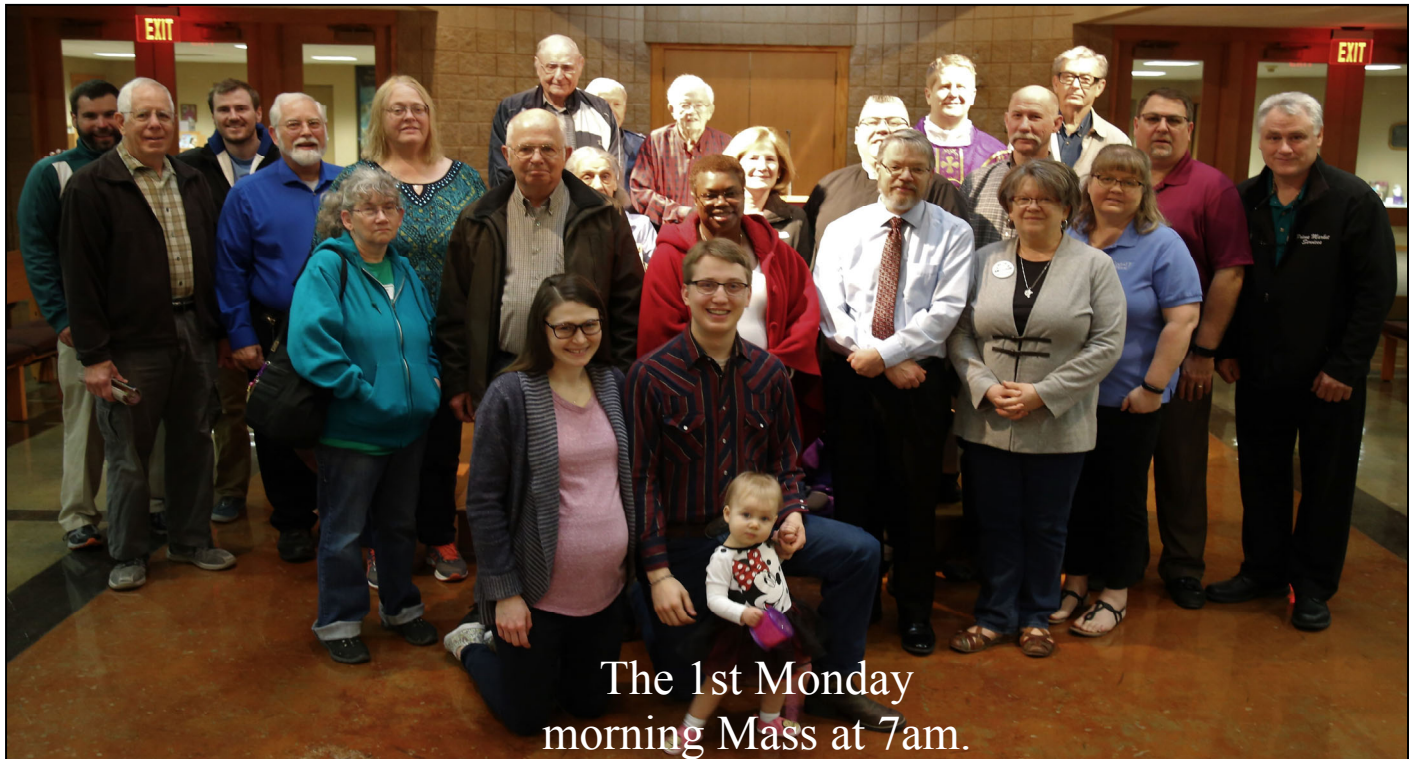
The 1st Monday morning Mass at 7am.

The PTO will be hosting an Easter Egg Hunt on Palm Sunday, April 9th . The hunt will begin a 10:00am in the Parish Hall. Toddlers through 4 th Graders may participate in the hunting.